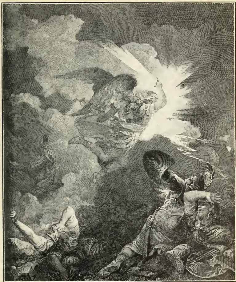
THE ANGEL DESTROYING THE ASSYRIAN CAMP From the Painting by P. J. Loutherbourg, R. A. Engraved by W. Sharpe.